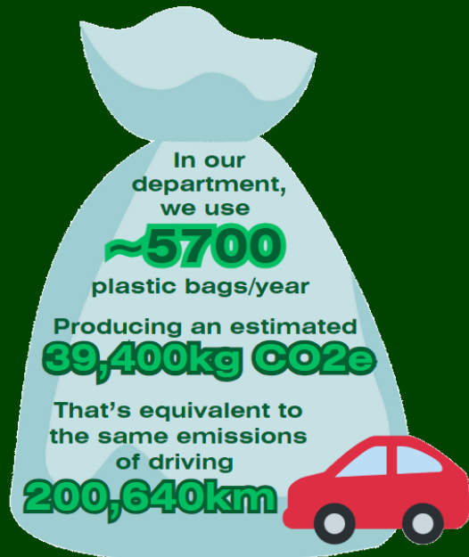
Figure 1 2

This project has led to an estimated 92% reduction in plastic patient belonging bag usage.